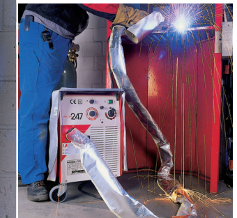
Protection tubing for torch welding hose