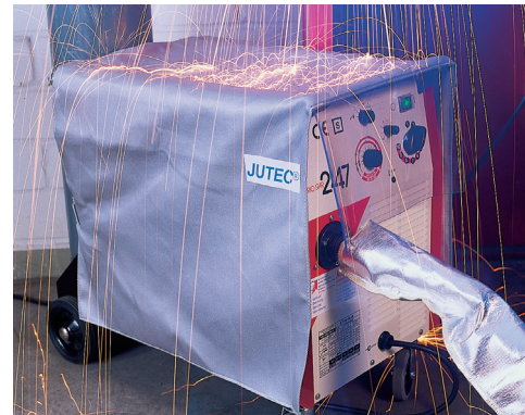
Welding machine protection jacket for contact heat