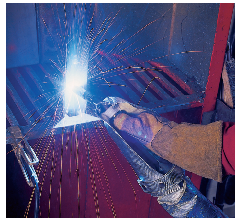
Welding pistol hand protection