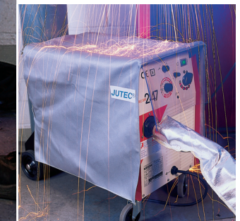
Protection jacket for welding equipment