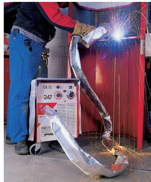
Protection tubing for torch tube package

This article is defined from the size of the jacket.