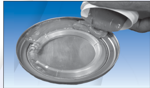
Duralco™ 4540 Bonds Heater Element to an Aluminum Tray