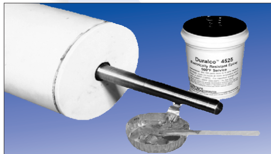
4525 Bonds a 316 S.S. Shaft to a Ceramic Piston Repairing a High Temperature Acid Pump