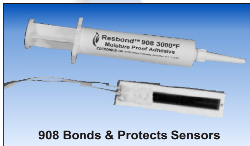
908 Bonds & Protects Sensors

Available in syringes or standard caulking cartridges.