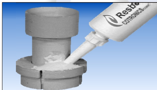
903HP Bonds a High Strength Ceramic Fitting for use at 2650°F