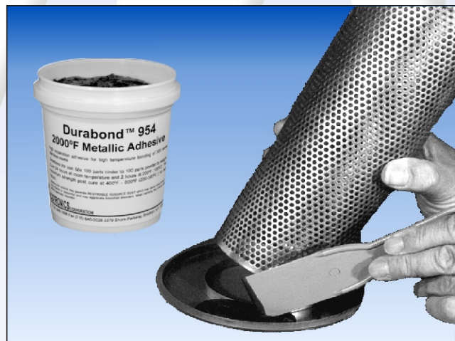
Durabond 954 Bonds a Stainless Filter Cartridge for use at 1200°F